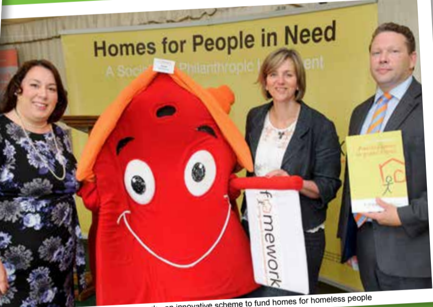
Midland MPs support the launch of Framework - an innovative scheme to fund homes for homeless people